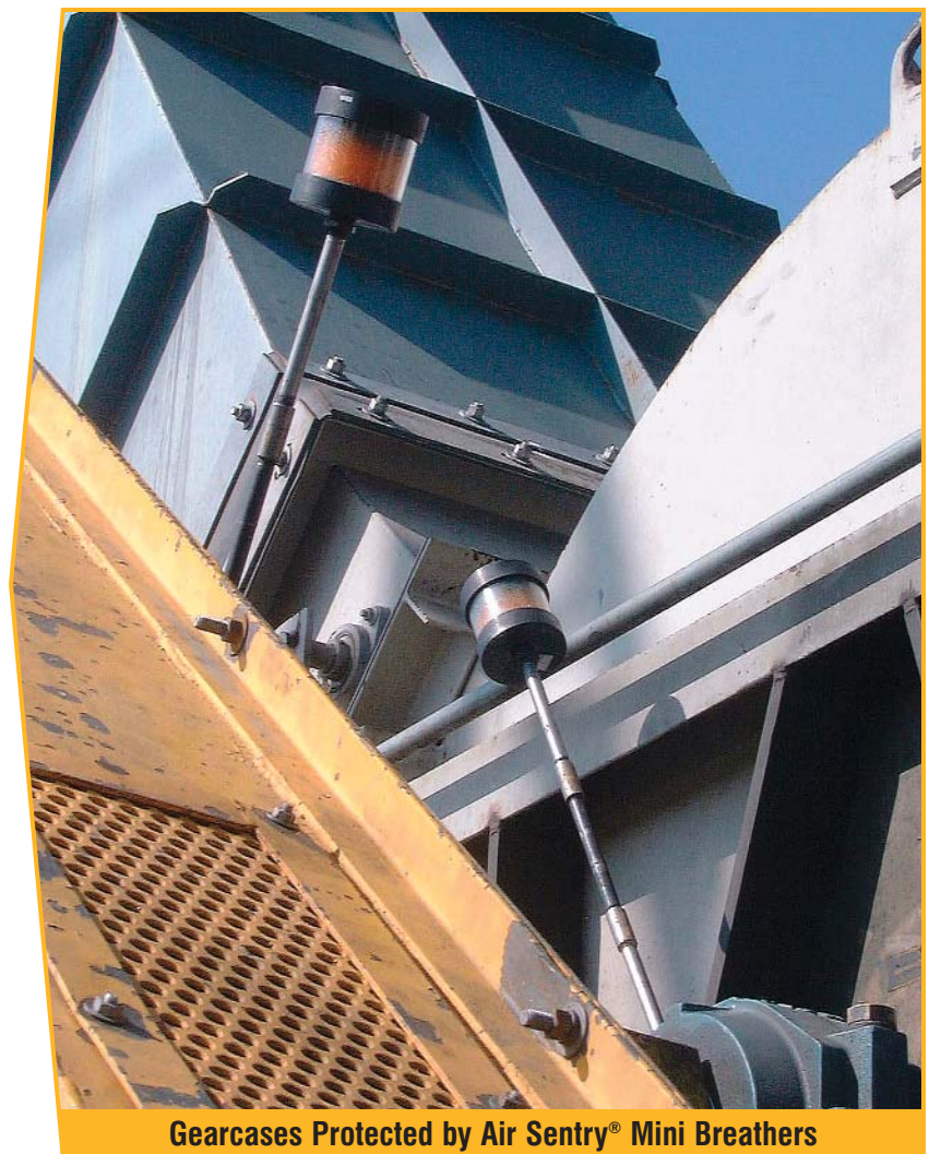
Gearcases Protected by Air Sentry® Mini Breathers

While it was a change in thought and concept, Deeter Foundry has found desiccant breathers to be a vital part of the maintenance and reliability optimization process. The plant realizes the benefits of desiccant filters every day. Many of the obstacles encountered in the beginning have been addressed. Such changes are not possible without the support of senior management and more importantly, the buy-in from your technicians. Good documentation and a continuing education can spell success for any program. ML