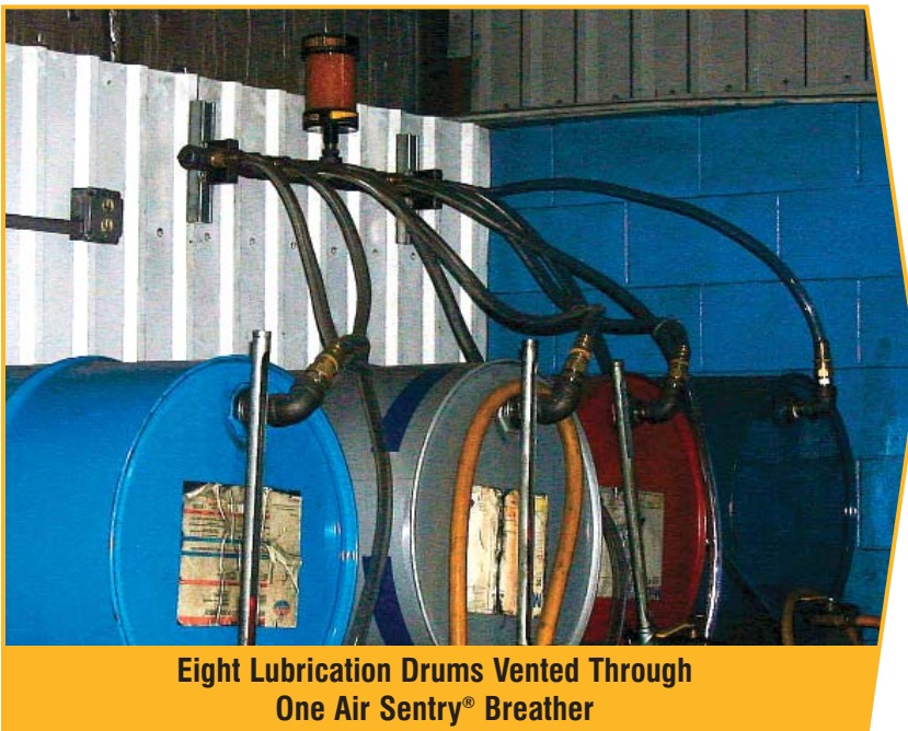
Eight Lubrication Drums Vented Through One Air Sentry® Breather

In the beginning, it reviewed different fill caps, breathers and vents. Nothing filtered the air well enough. To combat the water problem in the oil, a superabsorbent filter was used to remove the water from the oil. To reduce the water concentration in its hydraulic units, the author used a water gel filter. This type of filter has media in it which removes water. He consulted a filter manufacturer, providing information on each of the hydraulic units, such as size of unit, ppm of each unit, and the base oil sample. With this information, the filter manufacturer put Deeter on a program to change out the water gel filters. Upon discovering that